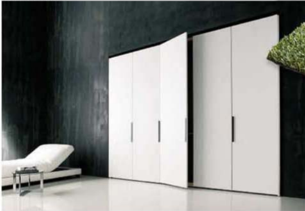
MILAN FURNITURE FAIR

3 STORAGE Urbanites favour clear, uncluttered spaces and choose storage units that fit their personal style to keep clutter behind closed doors.