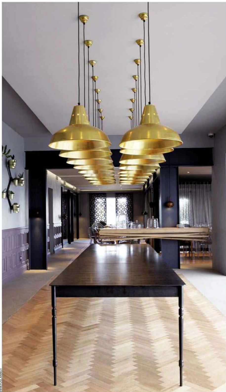
The striking entrance of Makaron restaurant in Stellenbosch. The Gregor Jenkin table is in raw steel and the planholders by Joe Paine. The Lightworld shades are anodised gold.

Etienne's trick: Multiply. A single pendant light doesn't command much attention but multiplied it becomes a showstopper. Complement this with simple décor in the rest of the room.