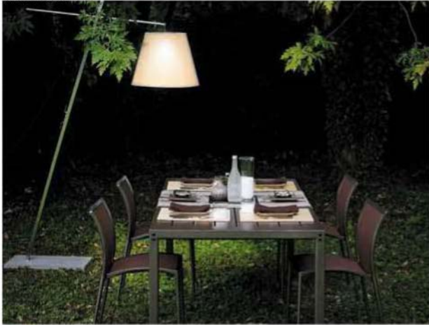
MILAN FURNITURE FAIR

1 INDOOR/OUTDOOR Urbanites love entertaining outdoors – indoor items often are carted outside. So look for items that live indoors but can also survive outside.