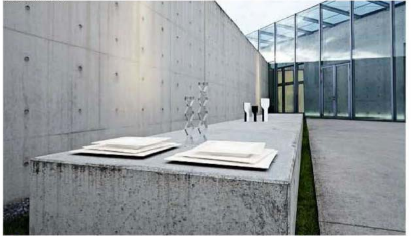
MILAN FURNITURE FAIR

2 CLEAN LINES AND DESIGNS Urbanites appreciate the simplicity of good design and invest in tableware and ornaments with unusual, interesting shapes.